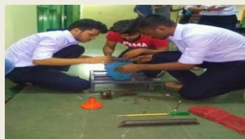
“Automobile gear box assembling and disassembling” an activity by MES held on November 21, 2018.