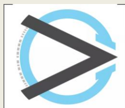
TACHYON-2019: Financial Support sanctioned by GAIL (India) Ltd., Vijaypur