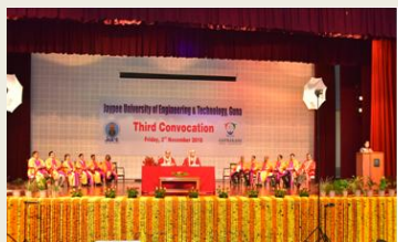
Third convocation held on November 02, 2018.