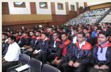
Degree recipients waiting for conferment of their degrees in third convocation.